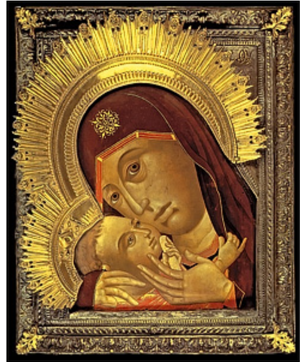
The "Kasperovskaya" Icon of the Most Holy Theotokos

The icon of the Mother of God, however, reveals another truth. The Mother of God tenderly embraces her Son, caressing Him as He clings to her. Like all mothers, she protects her child from every harm and danger. She reassures Him with the same maternal love every mother offers her child. Recognizing Him as God's greatest gift to the world, she lovingly and selflessly accepts her duty to defend this precious gift of Life Itself, regardless of the costs or consequences.