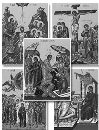
Large Festal Icons