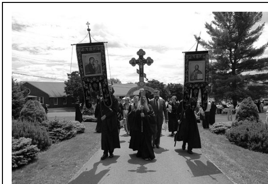
Following the Divine Liturgy on Memorial Day a procession is made to the monastery church where a Requiem Service is offered and the faithful pray for the departed brethren of the monastery as well as those who have lost their lives for their country.

So on a day so many go to Memorial Day parades and ceremonies, those at the monastery stick to their religion, praying for peace and enjoying their time together.