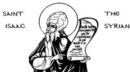
The Desert Fathers

Blessed is the one who knows his own weakness, because awareness of this becomes for him the foundation and beginning of all that is good and beautiful. Love sinners but hate their works; and do not despise them for their faults, lest you also be tempted.