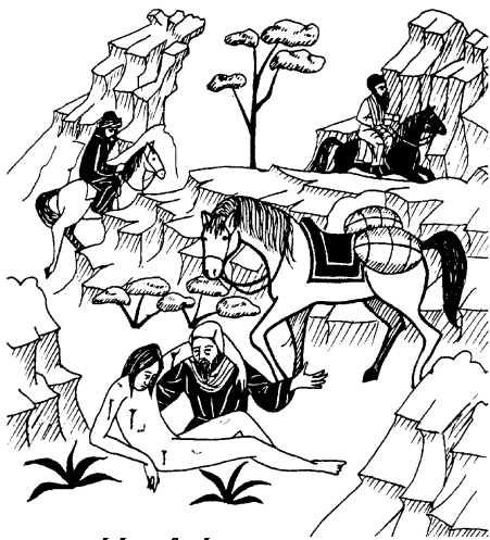
Parable of the Good Samaritan