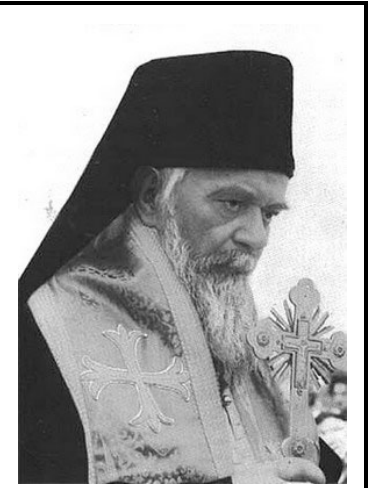
St. Nikolai Velimirovich (1881-1956) was a bishop of the Serbian Orthodox Church, an influential theological writer, and political emigrant to the United States, where he served as Rector of St. Tikhon's Orthodox Seminary.

Though modern sins come modern crisis. God really did use modern means to put some sense into modern people – He struck the banks, the stock markets, finances and currencies. He has overturned the tables of the exchangers of the world, just as He did a long time ago in the Temple in Jerusalem. He has created an unprecedented panic among the merchants and money exchangers. He lifts up, casts down, stirs, confuses, and frightens. All to make the wise little heads of Europe and America wake up; come to their senses and become more spiritual. So that being anchored in the harbors of material security, they might remember their souls, confess their transgressions, and bow down to the Almighty God – the Living God. How long will the crisis last? So as long as they people's spirit remains unchanged. Until those haughty people who caused this crisis capitulate before the Almighty. Until the people and the nations remember to translate the incomprehensible word crisis into their own languages so that they may say "God's judgment," instead of crisis and everything will be clear.