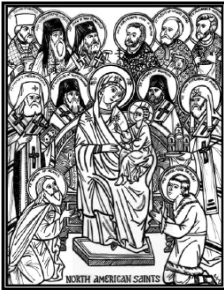
COMMEMORATION OF ALL THE SAINTS WHO HAVE SHOWN FORTH IN NORTH AMERICA