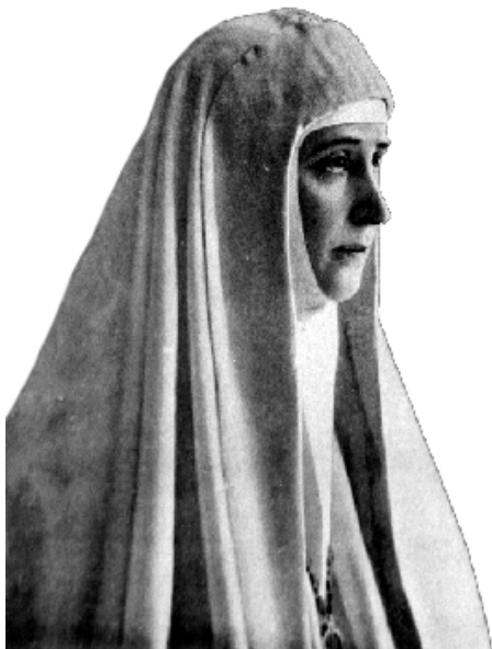
SAINT ELIZABETH THE NEW-MARTYR - COMMEMORATED JULY 5 -