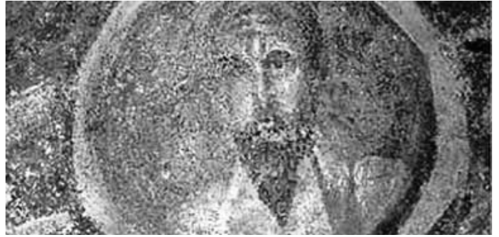
The 4th-century icon was found in the catacombs of St Thecla, not far from the Basilica of St Paul's Outside the Walls

It is widely believed that the spread of Christianity would not have been possible without St Paul. A Roman Jew from what is now Turkey, he founded churches throughout the Roman Empire. He was executed — it is believed beheaded — in AD65 for his beliefs.