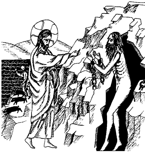
Christ Heals the Demoniac