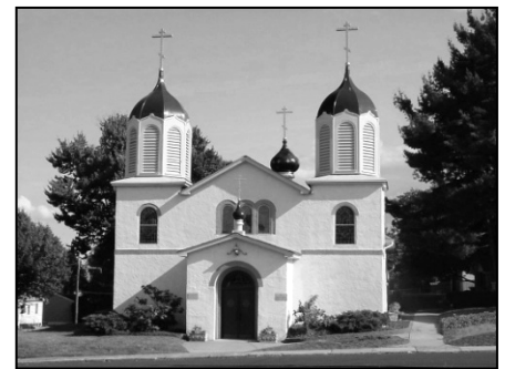
Ss. Peter & Paul Manville, NJ