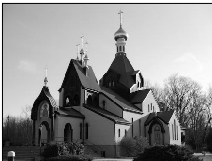
St. Alexander Nevsky, Howell, NJ

9:00 AM: Liturgy @ Ss. Peter & Paul 11:30 AM: Lunch / Free-time 4:00 PM: Deanery Vespers @ Ss. Peter & Paul 5:00 PM: Lenten Meal / Fellowship 6:00 PM: Departure for Delaware