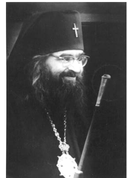
St. John Maximovitch during his time in Shanghai