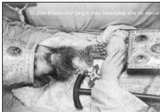
St. John Maximovitch lying in state immediately after his repose.