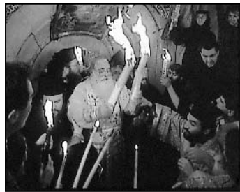
Distribution of Paschal Fire

The Clergy and Faithful now re-enter the church and the singing of the Paschal Canon, "This is the Day of Resurrection...", with numerous repetitions of the Paschal hymn, "Christ is risen...", begins. At many points during the Service the Clergy exclaim, "Christ is risen!" and the Faithful respond, "Indeed, He is risen!" The church is filled with the Faithful holding lit candles and the Clergy in bright vestments. At the conclusion of the Matins, the catechetical address of St. John Chrysostom is read, summoning all, even those who have come only at the eleventh hour, to the great Paschal Banquet. Matins is then followed by the Paschal Liturgy.