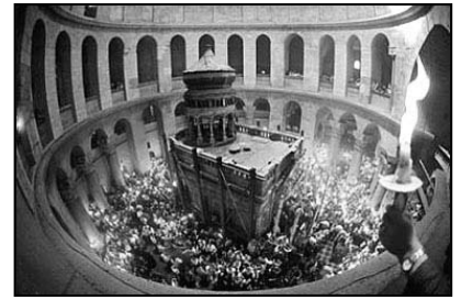
Faithful receiving the Paschal Fire at the Holy Sepulcher in Jerusalem.

At the stroke of Midnight, the clergy come out of the Holy Altar, all of the candles are lit, and a joyous, festive procession circles the church three times with the singing of the hymn: "Thy Resurrection, O Christ our Savior, the angels in heaven sing. Enable us on earth to glorify Thee in purity of heart." Then stopping before the closed outer doors of the church, the Priest reads the Gospel and exclaims the Paschal verses, "Let God arise...", while the Faithful sing the triumphant Paschal hymn, "Christ is risen from the dead, trampling down death by death, and upon those in the tombs bestowing life."