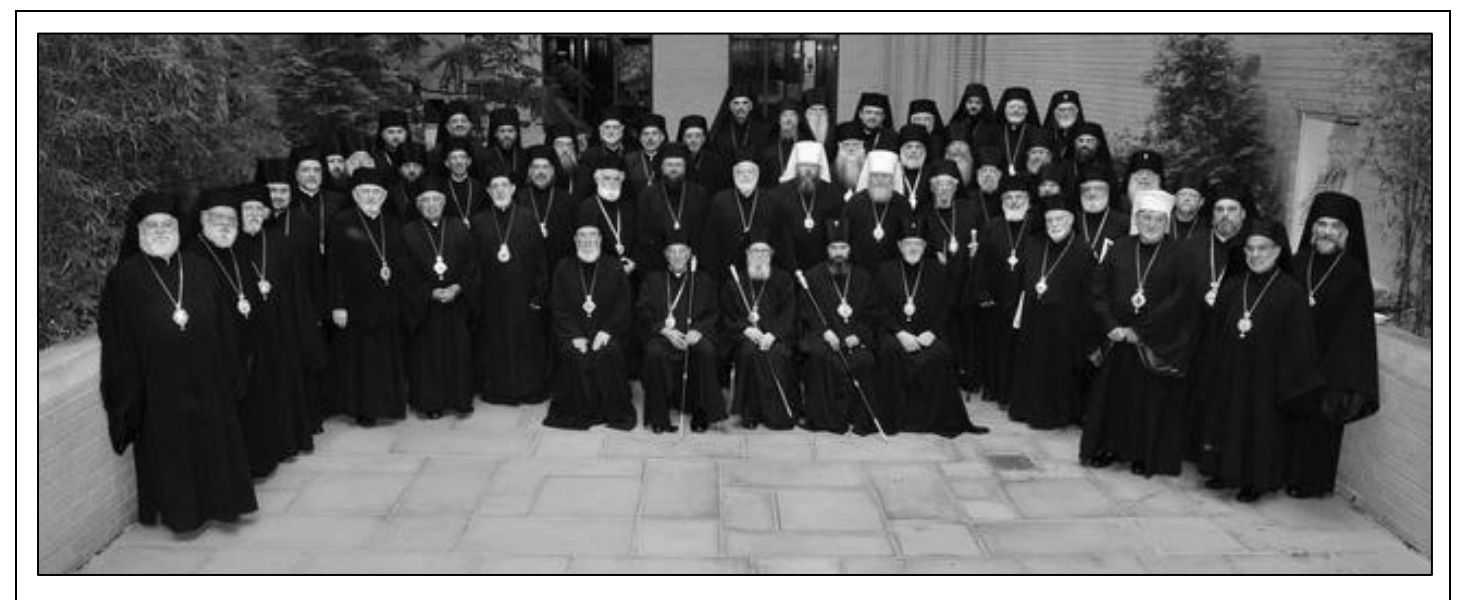
ASSEMBLY OF BISHOPS ISSUES MESSAGE ANNOUNCING MAY 25-27 CHICAGO MEETING Posted 5/18/2011 on OCA.org

CHICAGO, IL [OCA] -- In anticipation of the meeting of the members of the Assembly of Canonical Orthodox Bishops of North and Central America, the following message was issued on the Feast of Mid-Pentecost, May 18, 2011.