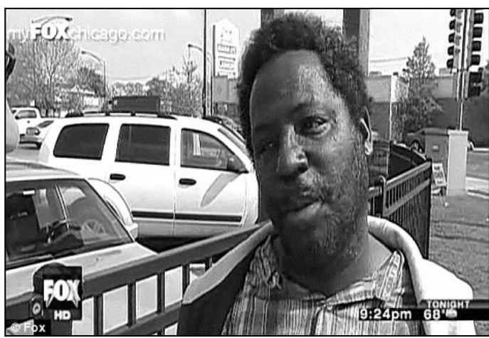
For additional coverage including a video report, please see: myfoxchicago.com.