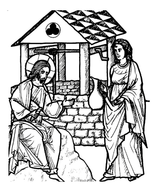
CHRIST & THE SAMARITAN WOMAN