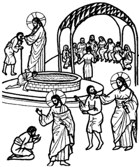
CHRIST HEALS THE BLIND MAN