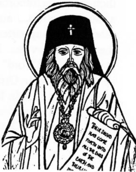
St. John of San Francisco