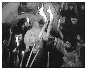
Distribution of Paschal Fire

The Clergy and Faithful now re-enter the church and the singing of the Paschal Canon, "This is the Day of Resurrection...", with numerous repetitions of the Paschal hymn, "Christ is risen...", begins. At many points during the Service the Clergy exclaim, "Christ is risen!" and the Faithful respond, "Indeed, He is risen!" The church is filled with the Faithful holding lit candles and the Clergy in bright vestments. At the conclusion of the Matins, the catechetical address of St. John Chrysostom is read, summoning all, even those who have come only at the eleventh hour, to the great Paschal Banquet. Matins is then followed by the Paschal Liturgy.