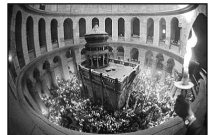
Faithful receiving the Paschal Fire at the Holy Sepulcher in Jerusalem.

At the stroke of Midnight, the clergy come out of the Holy Altar, all of the candles are lit, and a joyous, festive procession circles the church three times with the singing of the hymn: "Thy Resurrection, O Christ our Savior, the angels in heaven sing. Enable us on earth to glorify Thee in purity of heart." Then stopping before the closed outer doors of the church, the Priest reads the Gospel and exclaims the Paschal verses, "Let God arise...", while the Faithful sing the triumphant Paschal hymn, "Christ is risen from the dead, trampling down death by death, and upon those in the tombs bestowing life."