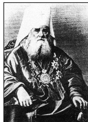
St. Innocent of Alaska Indication of the Way into the Kingdom of Heaven

Faith and love which are gifts of the Holy Spirit are such great and powerful means that a person who has them can easily, and with joy and consolation, go the way Jesus Christ went. Besides this, the Holy Spirit gives man the power to resist the delusions of the world so that although he makes use of earthly good, yet he uses them as a temporary visitor, without attaching his heart to them. But a man who has not got the Holy Spirit, despite all his learning and prudence, is always more or less a slave and worshipper of the world.