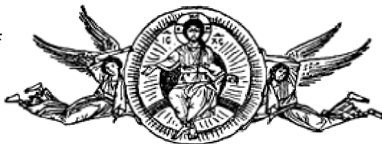
THE ASCENSION INTO HEAVEN

The Church is the gateway to the Kingdom. It is also the image of the Kingdom—it is our treasure house. So draw on the treasures in our worship, our Scripture, our icons, our music, our prayer, our theology. Use these treasures on your journey, on your pursuit to peace. Come to this refuge, and depart refreshed.