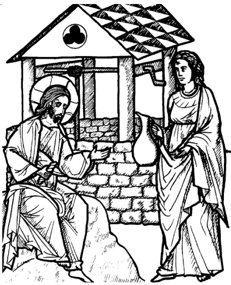
CHRIST & THE SAMARITAN WOMAN