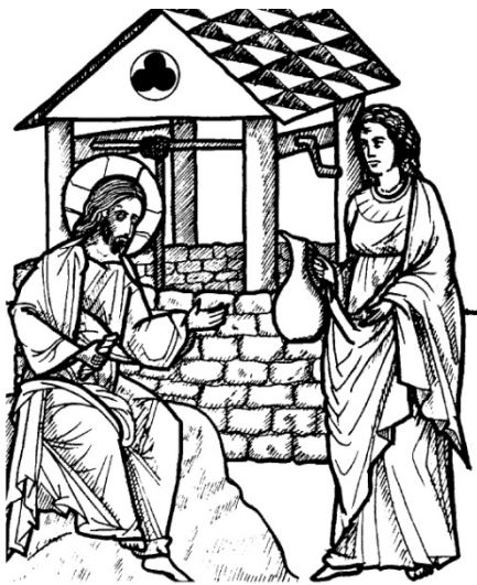
CHRIST & THE SAMARITAN WOMAN