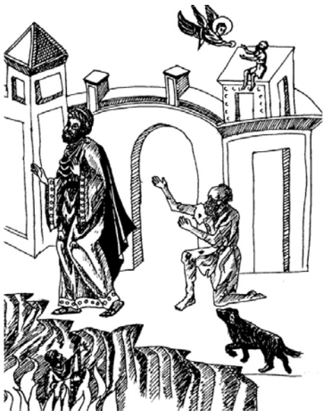
The Rich Man and Lazarus