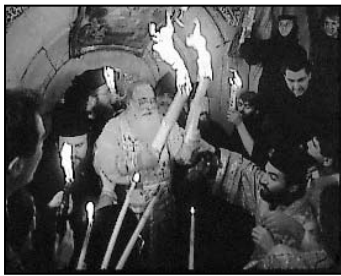
Distribution of Paschal Fire

The Clergy and Faithful now re-enter the church and the singing of the Paschal Canon, "This is the Day of Resurrection...", with numerous repetitions of the Paschal hymn, "Christ is risen...", begins. At many points during the Service the Clergy exclaim, "Christ is risen!" and the Faithful respond, "Indeed, He is risen!" The church is filled with the Faithful holding lit candles and the Clergy in bright vestments. At the conclusion of the Matins, the catechetical address of St. John Chrysostom is read, summoning all, even those who have come only at the eleventh hour, to the great Paschal Banquet. Matins is then followed by the Paschal Liturgy.