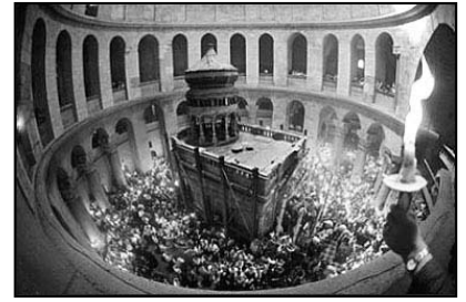
Faithful receiving the Paschal Fire at the Holy Sepulcher in Jerusalem.

At the stroke of Midnight, the clergy come out of the Holy Altar, all of the candles are lit, and a joyous, festive procession circles the church three times with the singing of the hymn: "Thy Resurrection, O Christ our Savior, the angels in heaven sing. Enable us on earth to glorify Thee in purity of heart." Then stopping before the closed outer doors of the church, the Priest reads the Gospel and exclaims the Paschal verses, "Let God arise...", while the Faithful sing the triumphant Paschal hymn, "Christ is risen from the dead, trampling down death by death, and upon those in the tombs bestowing life."